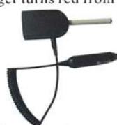
Charging with car charger