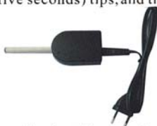
Charging with common charger

When the battery components fully screw into the charger, The indicator light is continuously flash 10 times (about five seconds) tips, and the indicator light on the charger turns red from green into the start of charging.